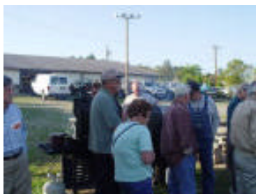
Feeding all the hard work and vendors