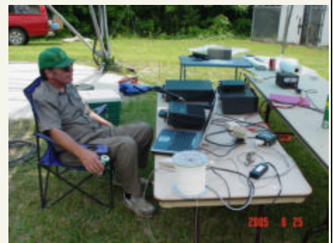
The Supreme Grit