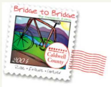
The Annual Bridge to Bridge Bike Ride

One of the many events held each year that use the assistance of the Amateur Radio family is the Annual Bridge to Bridge Bike Ride. This ride is held the third Sunday in September. This bike ride is hosted by the Caldwell County Chamber of Commerce and makes for an exciting day. Not only are we helping the Chamber by